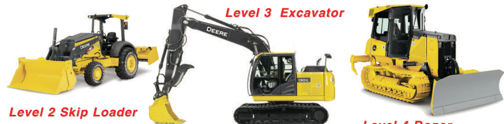
Level 2 Skip Loader